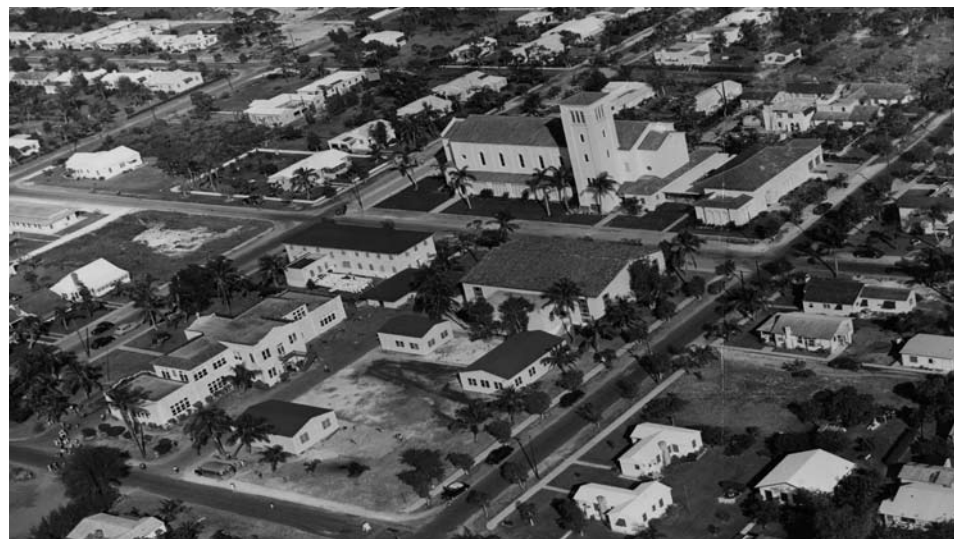
Aerial View of St. Anthony's Church and School.

Certainly this book has great significance to anyone who ever attended the church or school as well as those persons that are currently involved with Saint Anthony. Additionally, anyone interested in the overall history of Fort Lauderdale and the greater South Florida