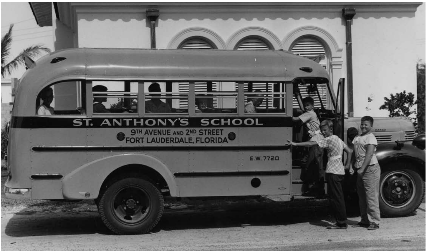
St. Anthony school bus.